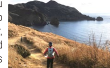
Image of Long Trail

In addition to the Izu Peninsula Geopark Footpaths, where you can enjoy walking easily, the long trails in the peninsula, which are 20km to over 100km, are also fascinating. Since these trails are long, you stay overnight and enjoy nature and culture. Especially in the Izu Peninsula, where you can go trailing throughout the year, you can have a profound experience by visiting geosites in different seasons.